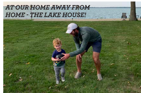
AT OUR HOME AWAY FROM HOME - THE LAKE HOUSE!