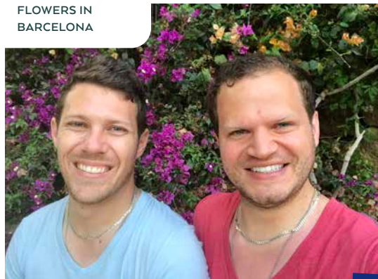
FLOWERS IN BARCELONA

We LOVE TO TRAVEL AND EXPLORE THE WORLD.