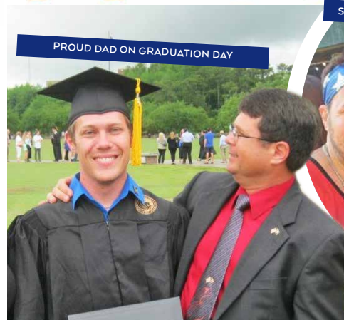
PROUD DAD ON GRADUATION DAY